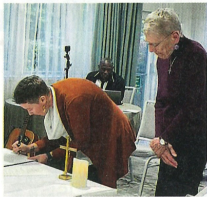
Sr Liz signs the Congregation vow book